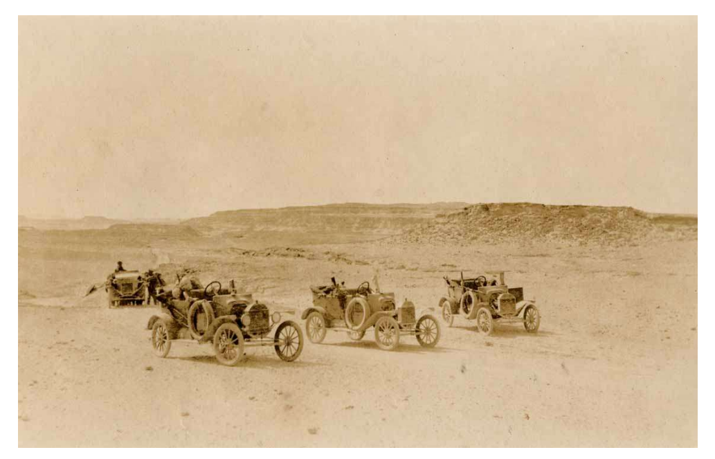
A Light Car Patrol in the desert<sup>5</sup>

These patrols covered great distances of unknown waterless and lifeless country as a normal routine... amongst other things they succeeded in mapping, with the aid of speedometer readings and compass bearings<sup>6</sup> a greater part of the northern desert, with its ranges of sand dunes, between the Nile and Siwa. Their exploits, with the crude vehicles they had, were astonishing.<sup>7</sup>