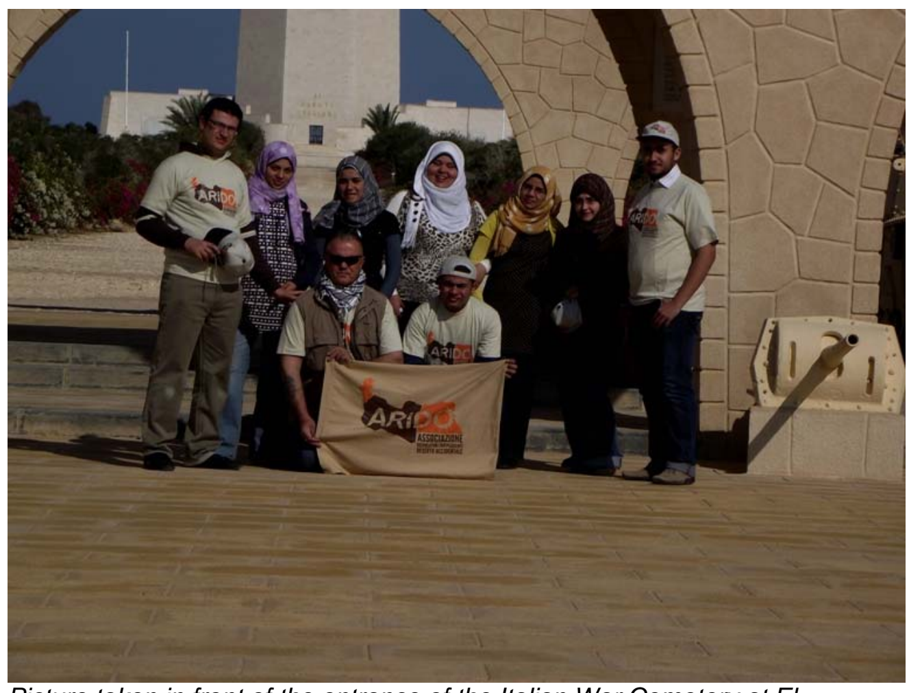
Picture taken in front of the entrance of the Italian War Cemetery at El Alamein: The architectural structure have given a positive impact to the students, whom have been impressed by the 'majesty and the sacredness of the place, deeply different from the others previously visited